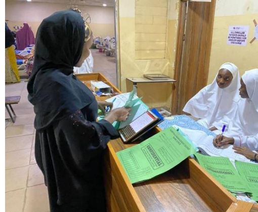
A cross section of Pictures showing the Jini Na Research Assistants (RAs) and Supervisors at work