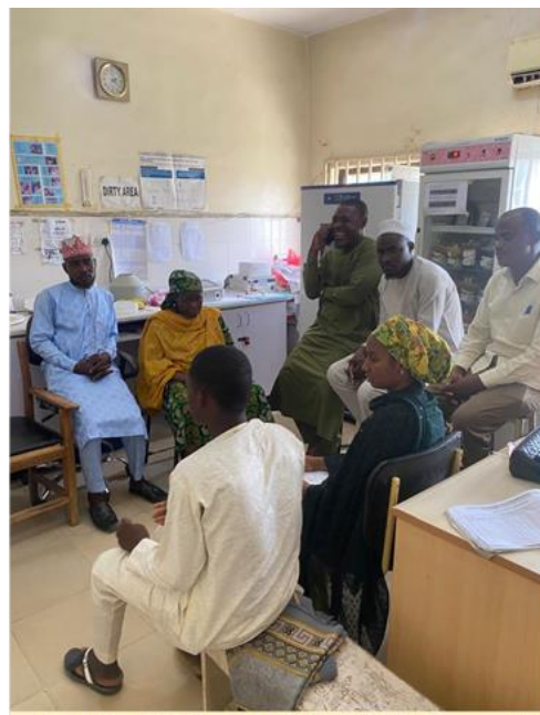
Jini Na FGD @ MAWTH (Group 2)