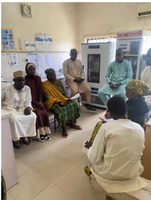
Jini Na FGD @ MAWTH (Group 1)