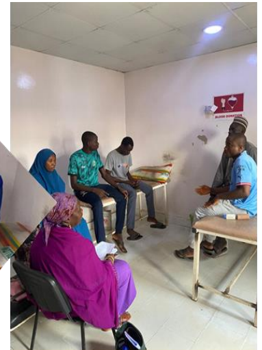
Jini Na FGD @ MMSH (Group 2)