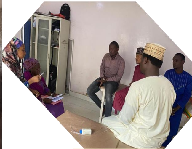
Jini Na FGD @ MMSH (Group 1)