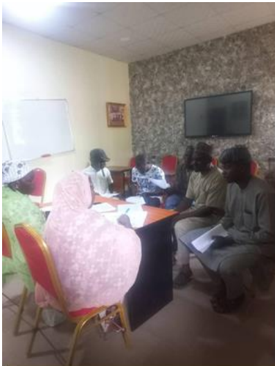
Jini Na FGD @ AKTH (Group 1)