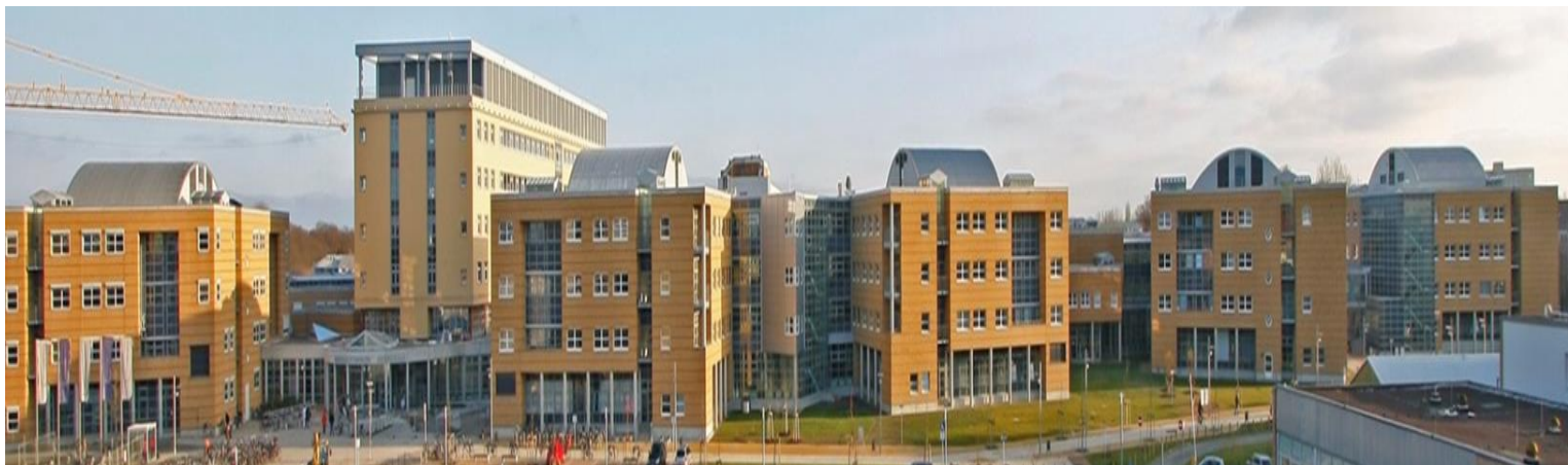
University Hospital Greifswald, Germany